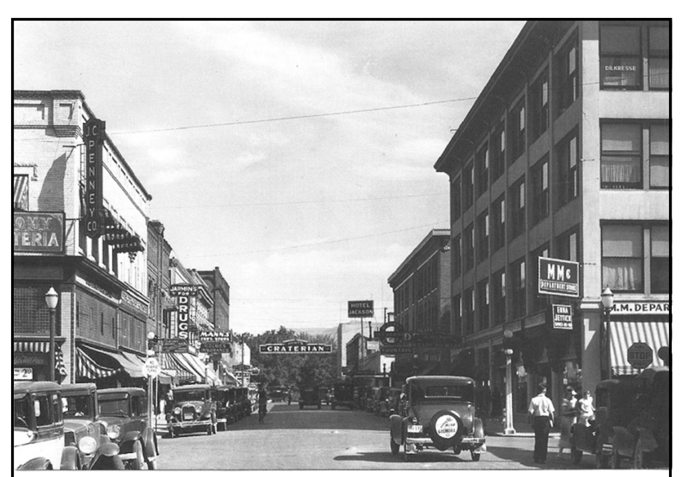
Medford Oregon - Looking south on North Central Avenue from 6th Street, about 1935 Building on the right is the Woolworth's building